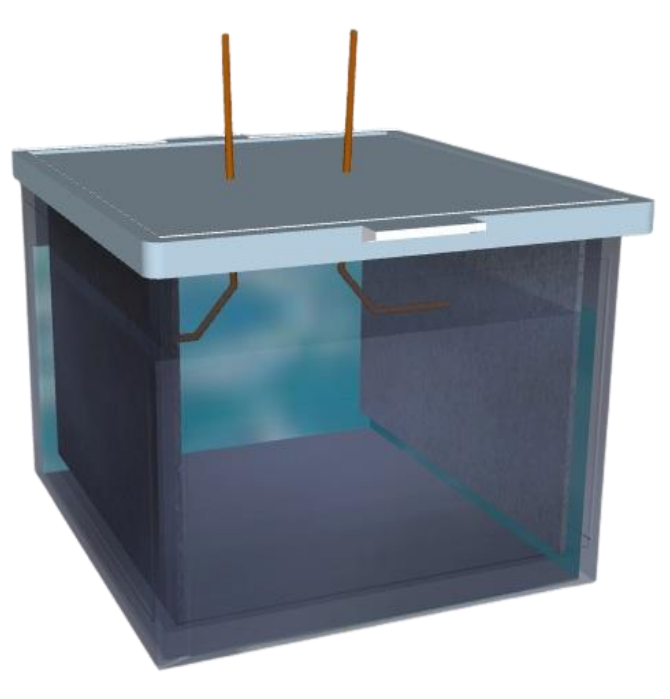
Fig. 2. Prototype Microbial Fuel Cells.

Three different electrode sizes (9, 25 \text{ and } 64 \text{ cm}^2) were adhered with glue to the internal walls of the cell, in which three holes were made in the central part, to pass a copper wire (Cu) to the outside of the MFC. A cross section was also made at each end of the MFCs so that the electrodes are in contact with the outside (see Figure 2).