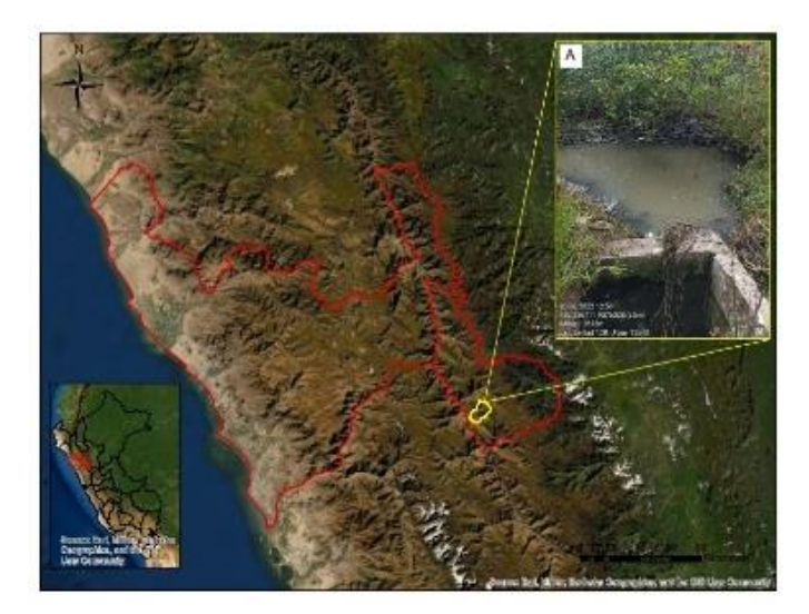
Fig. 1. Location of the wastewater sampling site, where (A) Wastewater storage pond.

Seven liters of wastewater were collected from a storage pond located in Urpay, Pataz, La Libertad, Peru (see Figure 1). The containers were washed with distilled water and sterilized using the water bath method, to eliminate the microorganisms present and/or any contaminant that could infer the results, finally they were left to dry at 21 °C for 12 hours.