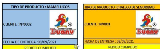
Fig. #5: Implementation of stickers in order deliveries

Phase 4: Seiketsu "Standardize", in the penultimate phase, the 5S committee together with senior management must commit to achieving the consolidation of the conservation of the previous phases and ensuring its persistence by standardizing the processes. Unnecessary objects are assigned an ID for quick identification and relocation out of the product development area.