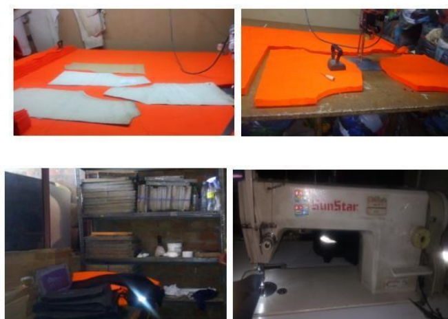
Fig. # 6: Order and cleanliness at workstations Source: self-made

Phase 5: Shitsuke "Discipline" The last phase is intended to generate, in the workers and throughout the company, habits of standardized methods and procedures in the previous phase, the 5S manager and the members of the committee, will lead them to carry out unexpected audits in the cutting area to verify compliance with each phase.