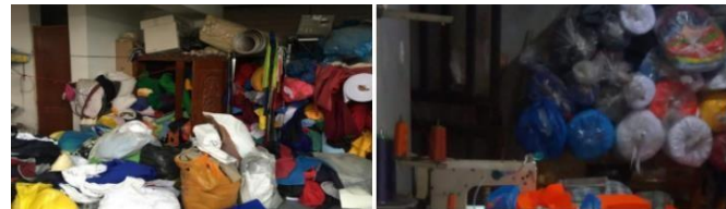
Fig. #3: Cut area before and after implementing the first S