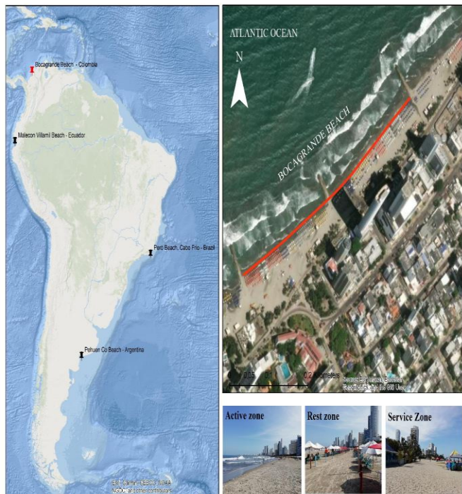
Figure 1. Location of study beach Cartagena (CO)

Figure 1 shows the sampling area, where 29 composite samples (sand, cigarette butts and fibers) were randomly collected between June and November 2022 at the Bocagrande pilot beach located in Cartagena de Indias, Colombian Caribbean ( 75^\circ 33' 42.0'' \text{ W } 10^\circ 28' 56.7'' \text{ NORTH} ).