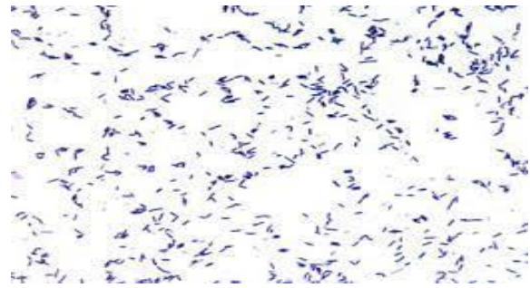
Figure 3. Gram-positive bacteria identified.

Molecular tests were conducted on two samples of Gram-positive bacteria (in the Figure 3) isolated from cigarette butts and sand retrieved from the active and service zones (Molecular analyses were conducted through the provision of services at CorpoGen Research and Technology). For these samples, molecular identification was carried out using isolation and purification of DNA, amplification of the 16S ribosomal gene using Polymerase Chain Reaction (PCR) technique, purification of PCR fragments and sequencing using the Sanger method, employing the 337F, 518F, 800R, and 1100R primers of the 16S ribosomal gene. Cleaning and assembling of sequences to obtain the query sequence.