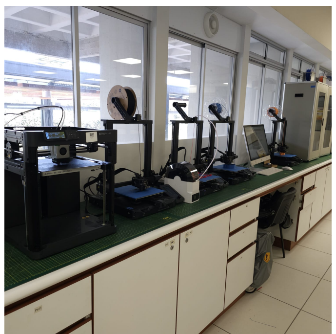
Fig. 2. FDM Printing Area of the Prototyping Laboratory

The 3D modeled parts can be printed with PLA (polylactic acid) or ABS (acrylonitrile butadiene styrene) filament, depending on the requirements of the mechanical design. The housings or enclosures can be made from acrylic or mediumdensity fiberboard (MDF) for rapid obtainment. The electronic circuits are mostly presented on a breadboard (protoboard), but they can be transferred to a PCB (printed circuit board) depending on the speed of each team's progress. For the development of visualization interfaces or applications, the use of MIT App Inventor is often recommended, the free and easily accessible platform developed by MIT. During Iteration 1, the functionality of each of the modules defined for each project is evaluated separately, through the writing of simple codes, which will later be used for error debugging. Iteration II involves the integration of PCBs with their respective protective housings and their linkage to the interfaces where