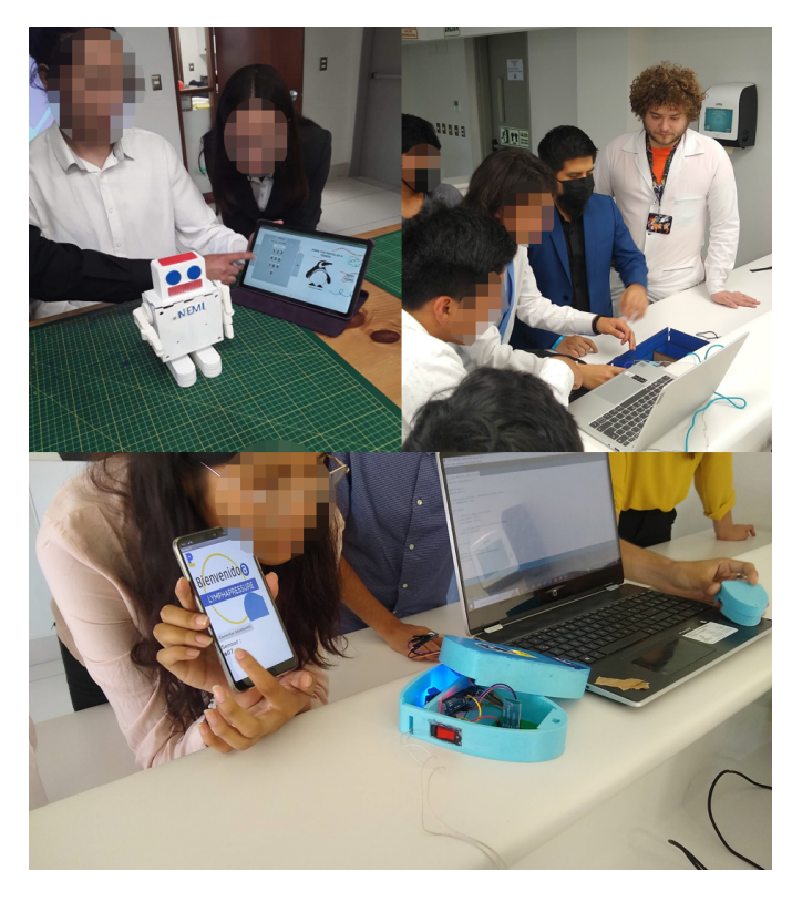
Fig. 5. Stage 3 Presentations by Timetable Groups on the Clinical Cases of Anemia, Diabetes Mellitus, and Fibromyalgia

To conclude the course, a poster fair is held to exhibit all the projects developed. In this fair, teams are evaluated by invited judges. Projects with the greatest potential are invited to complete an Invention Detail Sheet, to obtain an analysis of the potential patentability from the university's Intellectual Property Office (IPO).