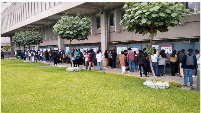
Fig. 6. Biodesign Fundamentals Poster Session: 2022-II

To conclude the course, a poster fair is held to exhibit all the projects developed. In this fair, teams are evaluated by invited judges. Projects with the greatest potential are invited to complete an Invention Detail Sheet, to obtain an analysis of the potential patentability from the university's Intellectual Property Office (IPO).