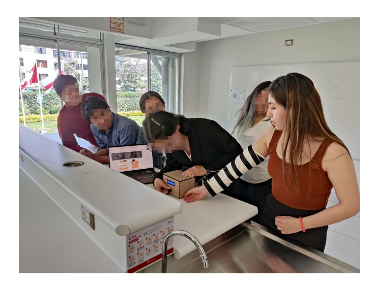
Fig. 4. Group Timetable Stage 3 Presentation on the Lymphedema Clinical Case

were a product to potential investors (professors). The pitchstyle presentation simulates a business situation where students must convince the professors of the feasibility and potential of their project, learning to highlight the most attractive and valuable aspects of their proposal. Additionally, they are asked to prepare a final report in the style of a scientific article using the IEEE template, to provide students with experience in writing this type of document.