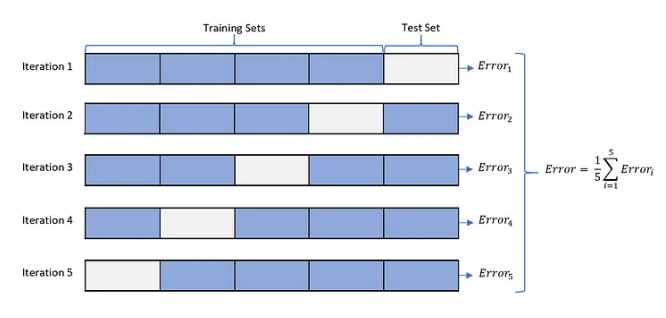
Fig. 4 Cross Validation: Source: [40].

The cross-validation approach is generally one of the most reliable among the different validation techniques, and it consists of randomly dividing the research dataset into some subsets that are called k-fold, parts of the subsets are used for testing, and the remaining for training. Finally, the number of subsets(k) determines the number of iterations, where in each cycle mathematical calculations are applied to each subset. The value of the parameter k can be any positive integer value, and the most common choice for practical purposes is usually k=5, which represents the above definition [40], see Fig. 4.