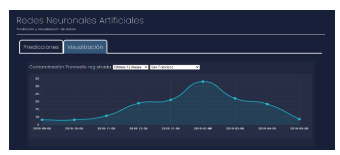
Fig. 5 Example of a histogram report about CO<sub>2</sub> data.

A histogram-type report is proposed, being a clear and accurate data visualization technique, specifically when it is desired to carry out historical data readings. It allows us to evaluate the behavior of contamination levels and to make respective comparisons between different periods. Additionally, it generates the possibility of being able to identify peaks in pollution levels for each of the sites that report CO_2 data, see Fig. 5.