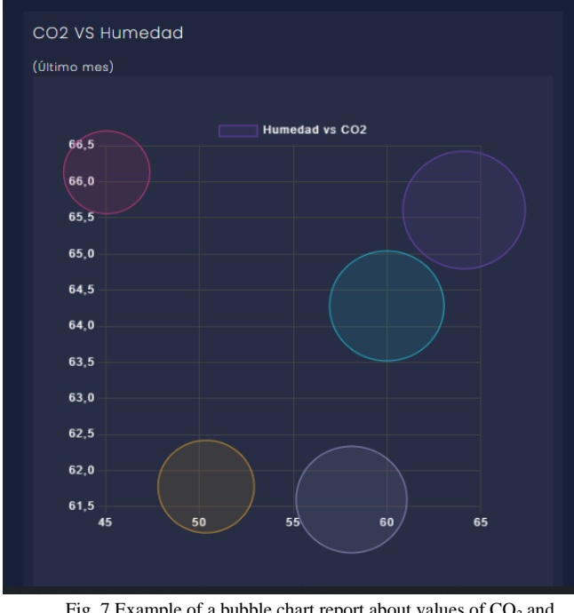
Fig. 7 Example of a bubble chart report about values of CO<sub>2</sub> and humidity.