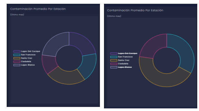
Fig. 6 Example of a pie chart report to make comparisons.

To read the pollution levels of all stations over the last month, it is necessary to identify a technique that provides clarity and reflects the information accurately. The pie chart allows us to visualize the information understandably and to make comparisons between all the stations simultaneously, which generates added value to the information. Additionally, it allows to discriminate between different data sets for an even more specialized visualization, see Fig. 6.