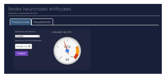
Fig. 8 Example of a gauge chart report to show the final prediction.

Gauges, or gauge charts, are a powerful tool that facilitates the understanding and interpretation of the predictions generated by ANN. In our case, the gauge chart shows a specific measurement of its reference limits, providing a representation of the estimated pollution levels, see Fig. 8.