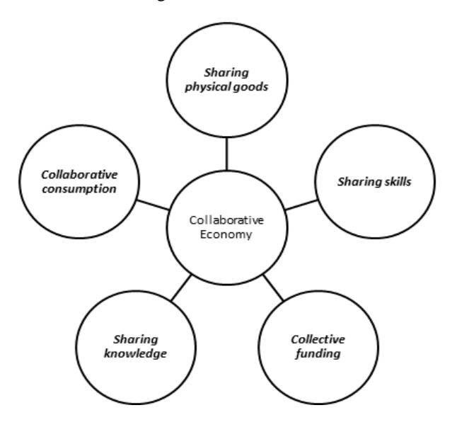
Fig. 1 Types of collaborative economy in contemporary times. Note: Prepared by the authors based on various scientific literature.

The research questions of this study were: