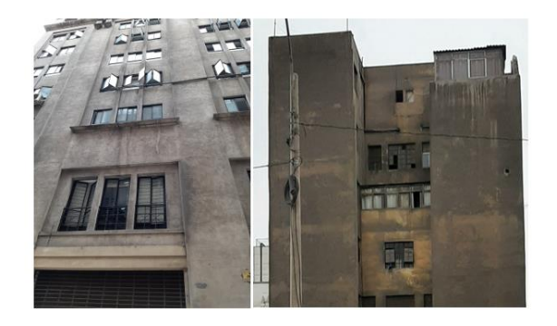
Fig. 2 Lima buildings impregnated with pollution.

In Peru, although it is not such a polluted country compared to others, the amount of pollutants in the air is notorious, in addition to being able to be seen in buildings as can be seen in Figure 2, these pollutants being able to damage them due to the different pathologies explained above, for which they must be constantly maintained and repaired. In an ESDA study (Environmental Performance Study) carried out by the Ministry of the Environment that was published in 2015, being the most recent of the data in Peru on air pollution, it shows us how throughout from 2002 to 2012, some of the emissions of polluting gases have increased, as well as some have been maintained, where the amounts emitted by Peru are appreciated in thousands of tons[10].