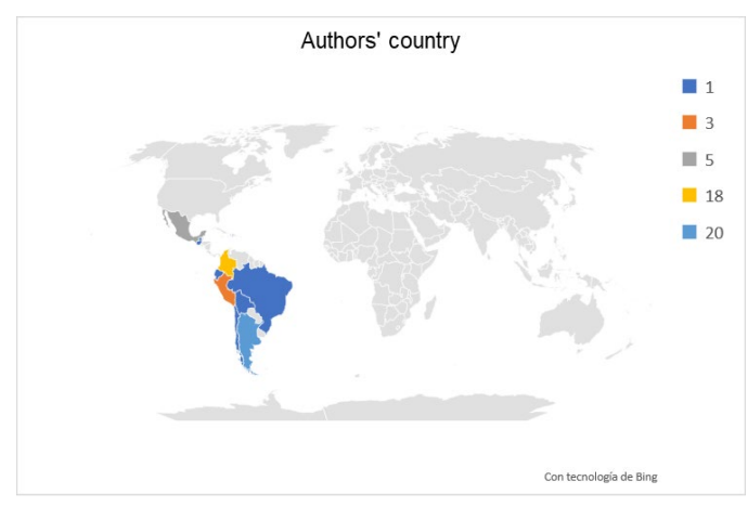
Fig. 4. Author's classification by country.