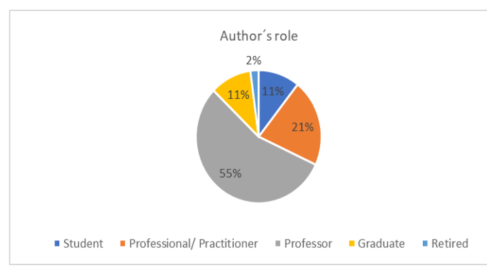
Fig. 1. Author's classification by role.

The variables considered to define the profile of the authors are: their current role, their academic degree, their engineering discipline, and their country of origin. In the variable related to their current professional function (role), more than half of the authors are faculty members in higher education, followed by professionals (see Fig. 1).