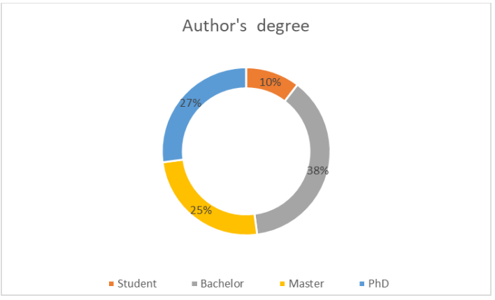
Fig. 2. Author's classification by academic degree.

Authors were also classified regarding their highest academic degree. These results are shown in Fig. 2. It can be observed that 38% of the authors have a Bachelor degree, 27% a PhD, 25% a Master's degree, and 10% are still studying an engineering program.