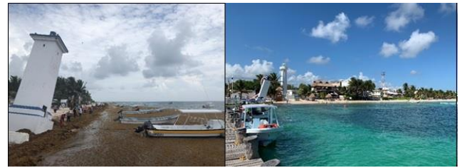
Fig. 2 Sargassum at Puerto Morelos (Sep. 2018) and Puerto Morelos Beach without Sargassum (Oct. 2019)

During the summer of 2018, the arrival of more than 20 million tons was estimated, distributed in the Riviera Maya. The beach of Puerto Morelos was seen affecting between 5 and 7 meters from the shore to the sea, and the natural blue view turned brown (see Fig.2). The impact of the sargassum phenomenon in the Riviera Maya has relation to the reduction of international and national tourists (occupancy levels of 75% compared to 90% in the same season 2 years earlier). Another negative effect is the impact on the reef, with 40% damage, killing the reef and related fauna. Sargassum phenomenon is an environmental crisis facing the communities of the Riviera Maya and Puerto Morelos, this was one of the reasons for applying the pilot test of the instrument. A second reason is the link that exists with the community of Puerto Morelos and TEC university, for two years, 40 students and teachers develop sustainability and social projects with the community.