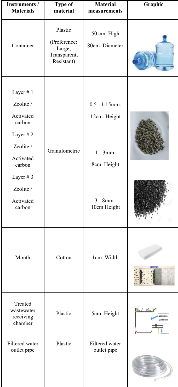
TABLE I Composition of biofilters based on zeolite minerals and activated carbon