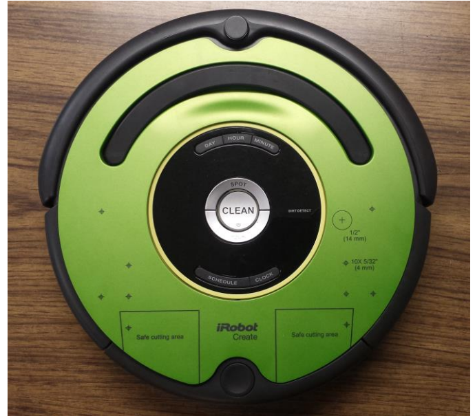
Fig. #1 iRobot Create ® 2

iRobot Create® 2 (Fig. #1) is an educational robot easily available and ready to be used by students [1]. The robot comes with a charging dock and a serial-to-usb cable. The robot is actually the base platform for the popular vacuum cleaner, Roomba, and it can be used for many creative projects. iRobot Create® 2 also has the advantage to be programmable, portable, and has built-in sensors that can be used for advanced programming. In developing countries where many universities cannot afford expensive standard equipments for their students, iRobot Create® 2 is an excellent tool to learn practical robotics and programming.