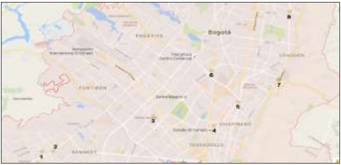
Fig 2. Location of the information points.

The specific points of application of surveys in the zones shown in the previous map were selected from the special report 14: Cycle routes Bogotá [19], which tracks the use of the city's cycling system Of Bogotá, elaborated by the Consortium Monitoring Transit and Urban Transportation Bogotá. Based on this study, the three of the highest traffic of related cyclers were chosen in the performance. In Figure 2, the location of the collection points of the information where the surveys were applied in the city of Bogotá is shown. According to the above, the sample design yielded 384 surveys for a 95% confidence interval. For the application of the surveys, three zones are selected that are shown in the fig. 2.