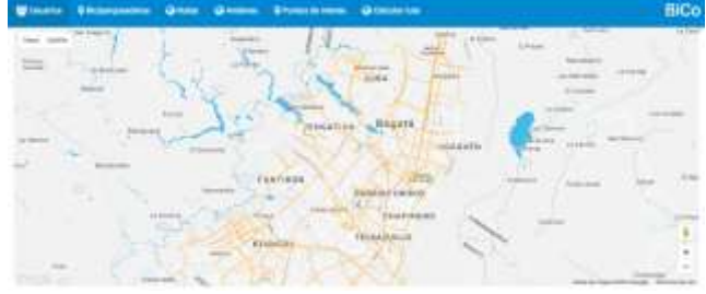
Fig. 6 Cycle routes and bike lane.

A map of the city of the network of cycle route and bicycle route in Bogota (see Fig. 6).