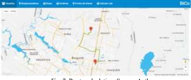
Fig. 7. Route calculation. Registered users in the system (see Fig. 8)

Calculation and mapping of a route from a source point to a destination point on a map, taking into account the network of cycle route and bike lane (see Fig. 7).