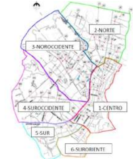
Fig 1. Division of zones – 2013 studies.

According to the above, the sample design yielded 384 surveys for a 95% confidence interval. For the application of the surveys, three zones are selected that are shown in the fig.1.