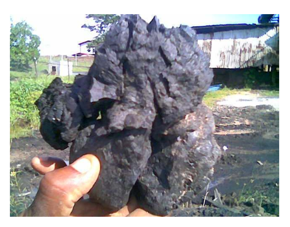
Figure 3 - Crude Asphalt