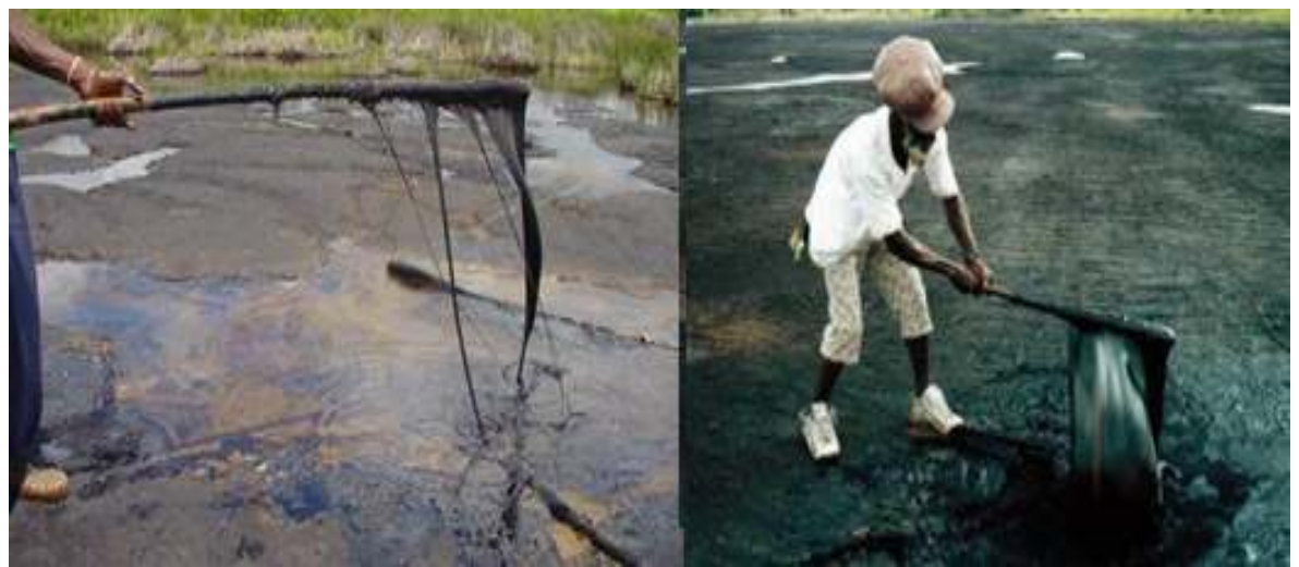
Figure 2. Crude Asphalt as seen from the surface of the pitch lake, Trinidad