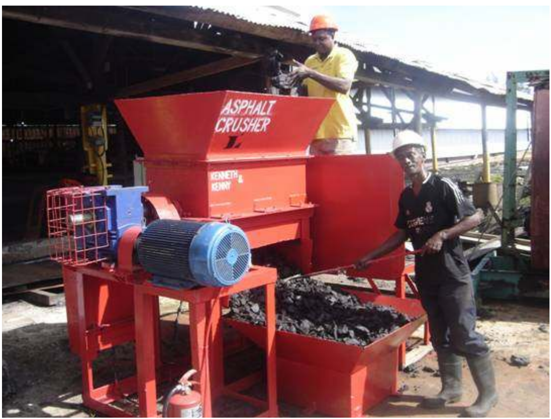
Figure 5 Fully functional crude asphalt crusher

The sieve is made of two BRC wire pieces of gauge 65, 75 mm x 75 mm welded together. Therefore the thickness of a strand of BRC wire was doubled, and this increased its strength to withstand the rigors of the crushing operation. The fully functional crude asphalt crusher is shown in Figure 5.