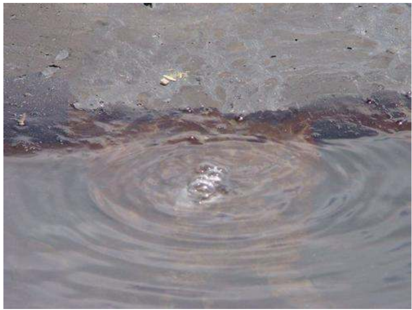
Figure 1. Burbles from the water surface of the lake

The lake is active and producing the pitch for centuries. The lake burbles, hisses and occasionally spits fire and its smell can be felt miles away, due to the sulphur which stinks like rotten-eggs. Figure 1 shows the burbles from the water surface of the lake. Several researchers have worked on the chemical, geographical, biological processes connected to this natural asphalt lake. The origin of this lake is linked to deep faults in the connection with subduction under the Caribbean Plate of the Barbados Arc, which allowed oil from a deep deposit to be forced up millions of years ago. The lighter elements in the oil evaporated, leaving behind the heavier asphalt. When subterranean bitumen (from which asphalt is mostly done) leaks to the surface, it creates a large puddle or lake, improperly called tar pits. Figure 2 shows the crude asphalt from the lake. Till date, only two large asphalt lakes have been found along with three smaller asphalt pits, all in the Western Hemisphere. Table 1 provides the information of these lakes.