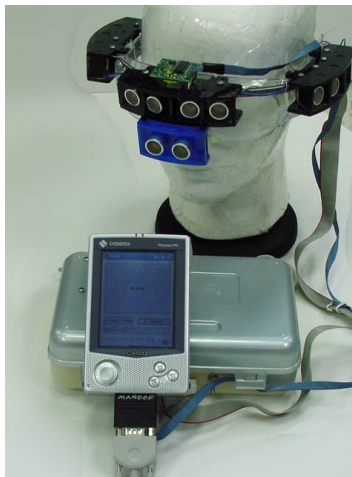
Figure 1. A Picture of the System

The objective of this project is to explore the potential of a technological alternative to the cane, which is currently the device most commonly used by blind individuals to navigate in closed environments. This overall goal, in turn, defined some of our engineering design goals, in terms of the required portability and lightweight of the system, so that the user can wear it without having to sacrifice on mobility, or having to carry cumbersome equipment. In order to accomplish this mobility, a Pocket PC was chosen as the platform for the 3D Sound Rendering Engine, which provides sufficient amount of processing power, an acceptable battery life, while simultaneously fostering user mobility, as required. A second consideration would be to develop software for the system, which must be efficient enough to run on the limited resources provided by the Pocket PC, without sacrificing much on the final result. It is pertinent to keep in mind that the system should require as little attention as possible from the user, since it could be used for prolonged periods of time. And finally, it is also important to take simplicity into account, to create a dependable solution. A picture of the resulting system is shown in Figure 1.